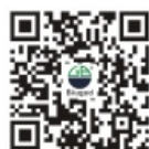
Scan for video