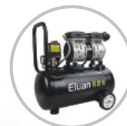
Dry Air Generator