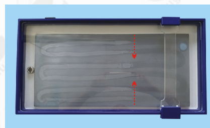
Film Forming Point